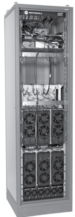
GTR 8000 Expandable Site Subsystem

Designed to carry your needs into the future, the G-series hardware platform has built-in functionality and flexibility with an AC/DC - 48VDC power supply and two-branch receive diversity capacity, as well as a linear power amplifier for improved coverage in P25 FDMA Simulcast systems.